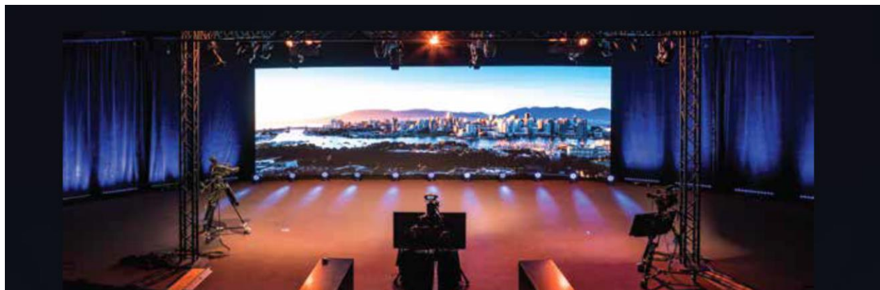
Recovery Day BC 2020 Virtual Stage

Email pr@lastdoor.org online payment link is also available, once application received.